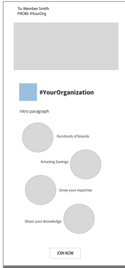
"Join Now" Email

Many of our partners qualify for our new co-branded media opportunities. For these opportunities, ExpertVoice will invest our media dollars in your efforts to let your members know about the benefits of our partnership.